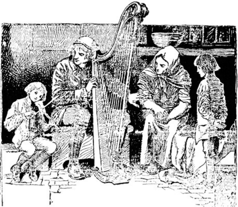
SEPPERL PLAYING ON TWO STICKS