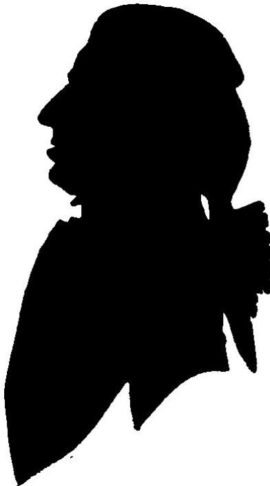
SILHOUETTE OF HAYDN

And here is a picture which shows exactly how the "good-natured sort of fellow" looked.