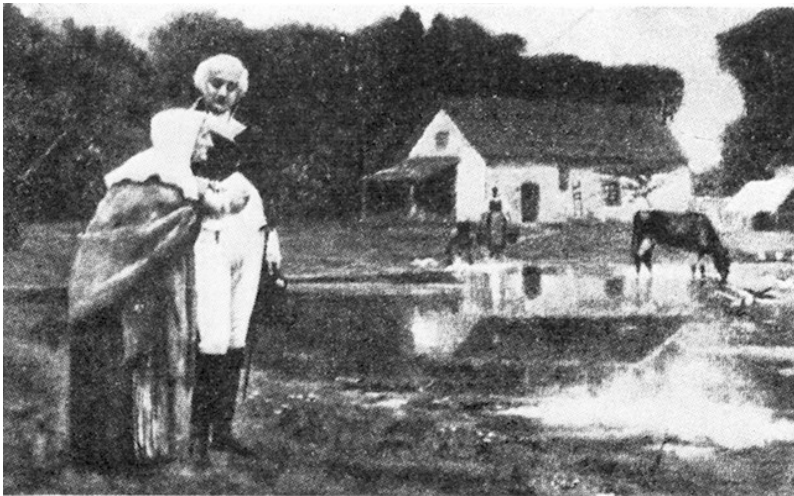
WASHINGTON LEAVING HOME

Washington's father died in the year when he and Joseph Haydn were ten years old. This is a picture of Washington, as a man, bidding his mother good-bye before leaving for a war.