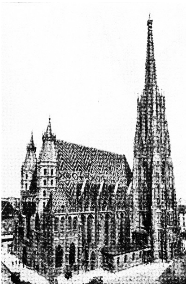
ST. STEPHEN'S CHURCH

There was much else to do in the great church besides singing in the choir. There were music studies, of course, in singing, violin and piano playing. But there were also school studies to be learned every day. These were Religion, Latin, Writing and Arithmetic.